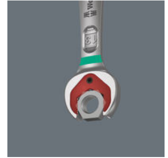
Ring ratchet spanner Joker 6000

The Joker's holding function means that nuts and bolts can be held in the jaw and easily positioned where they are needed. Fastening on to the thread can then be done quickly and safely, thanks to the innovative special stop-plate which holds the fastener. No more time-wasting searches for dropped nuts and bolts! After applying and positioning the nut or bolt, fastening can begin immediately - no additional tools required.