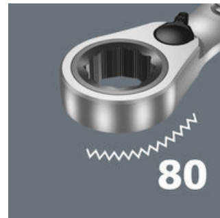
Fine tooth mechanism

The ratcheting feature at the ring end boasts an exceptional, fine tooth mechanism - 80 teeth in all - which provides greater flexibility, even in very confined workspaces.