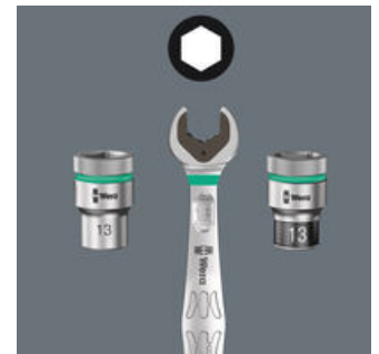
“Take it easy” tool finder

Take it easy tool finder system - with profile and size colour-coding for quick and easy tool selection. Colour-coded system for hexagon drive screws (L-Keys, Zyklop bit sockets), external hex drive screws and nuts (Joker wrenches, Zyklop sockets and Zyklop bit sockets with holding function), and TORX® drive screws (L-Keys, Zyklop bit sockets).