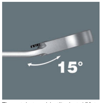
The ratchet end is tilted at 15° to the tool axis, making application of the tool in confined spaces much easier.