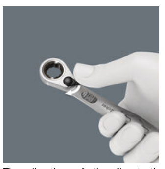
The direction of the fine-tooth ratchet mechanism can easily be changed via the smooth switch lever.