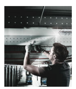
With the Joker, you can now loosen and tighten nuts and bolts, in situations where conventional tools fail. Particularly in confined spaces, where conventional open-jawed wrenches cannot be used. The combination of limit stop and small return angle enables eff ective work, even on screw pipe connections.