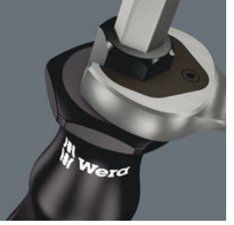
Greater torque can be transferred by fitting an open-jaw or ring spanner over the integrated hex bolster.

A hexagon blade made out of highquality bit material extends right through the handle - thereby ensuring full transfer of force, even when struck with a hammer. The ductile tempered material prevents the blade from splintering or breaking.