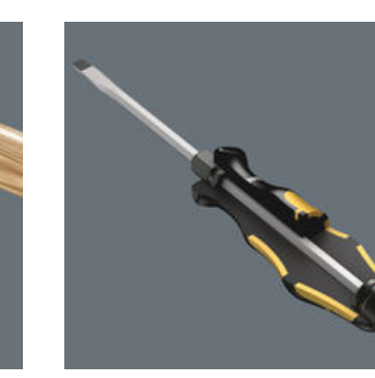
integrated impact An cap lengthens the service life and reduces the danger of splintering. Nevertheless, always wear protective goggles.

A hexagon blade made out of highquality bit material extends right through the handle - thereby ensuring full transfer of force, even when struck with a hammer. The ductile tempered material prevents the blade from splintering or breaking.