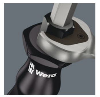
Greater torque can be transferred by fitting an open-jaw or ring spanner over the integrated hex bolster.