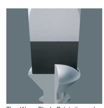
The Wera Black Point tip and a refined hardening process ensure long service life of the tip, improved corrosion protection and an exact fit.