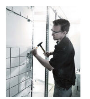
Screwdrivers are often misused as chisels. This can be dangerous. The chiseldriver is the solution when not only screwdriving is required. For fastening, chiselling and loosening seized screws. Wera chiseldriver: the screwdriver whenever the going gets tough!