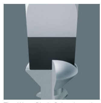
The Wera Black Point tip and a refined hardening process ensure long service life of the tip, improved corrosion protection and an exact fit.