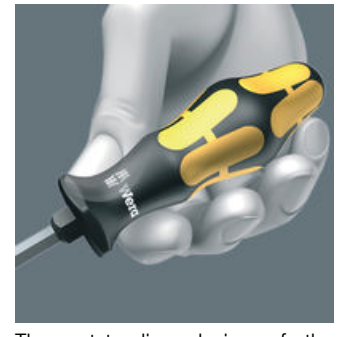
The outstanding design of the Kraftform handle that fits perfectly into the hand prevents hand injuries such as blisters and calluses.

The basic idea for the prototype of the Kraftform handle - that the hand should dictate the design has, right through to today, proved to be correct. In cooperation with the internationally recognised Fraunhofer IAO Institute, Wera developed a screwdriver handle designed to match the shape of the human hand as long ago as the 1960s. After a long development phase, the Wera Kraftform handle was launched to the market in 1968. It has been optimised through the years with new technologies, but has kept its proven shape. After all, the human hand has not changed either.