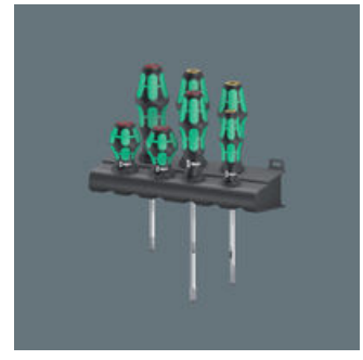
Including useful rack for wellarranged storage of the screwdrivers.