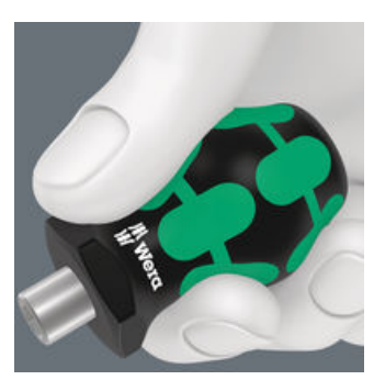
The 2-component Kraftform handle allows high power transmission due to the non-slip, softer grip areas and high working speeds due to the hard grip areas, which allow a quick hand switch.