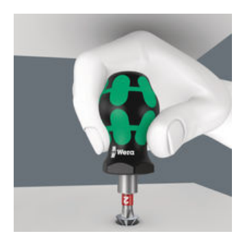
With its compact handle shape and the short blade, the Kraftform Stubbies are particularly suitable for working in confined screwdriving situations.