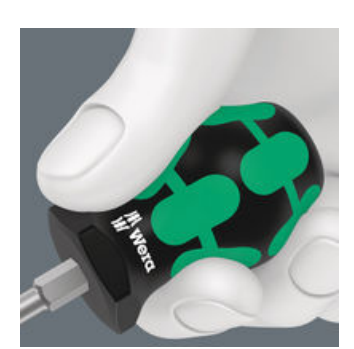
The 2-component Kraftform handle allows high power transmission due to the non-slip, softer grip areas and high working speeds due to the hard grip areas, which allow a quick hand switch.