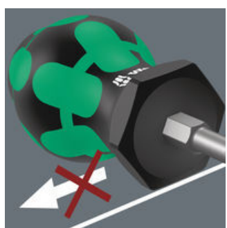
The hexagonal non-roll feature prevents any rolling away at the workplace.

Web link https://products.wera.de/en/screwdrivers_kraftform_plus__series_300_stubby_set_3.html