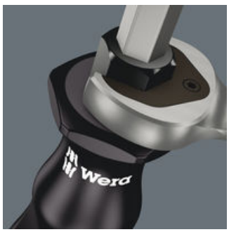
Hexagonal blade and bolster for higher torque transfer.

Further versions in this product family: