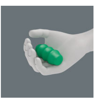
The basic idea for the prototype of the Kraftform handle - that the hand should dictate the design has, right through to today, proved to be correct. In cooperation with the internationally recognised Fraunhofer IAO Institute, Wera developed a screwdriver handle designed to match the shape of the human hand as long ago as the 1960s. After a long development phase, the Wera Kraftform handle was launched to the market in 1968. It has been optimised through the years with new technologies, but has kept its proven shape. After all, the human hand has not changed either.

Further versions in this product family: