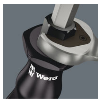
Hexagonal blade and bolster for higher torque transfer.

Further versions in this product family: