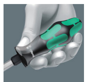
The outstanding design of the Kraftform handle that fits perfectly into the hand prevents hand injuries such as blisters and calluses.

The basic idea for the prototype of the Kraftform handle - that the hand should dictate the design has, right through to today, proved to be correct. In cooperation with the internationally recognised Fraunhofer IAO Institute, Wera developed a screwdriver handle designed to match the shape of the human hand as long ago as the 1960s. After a long development phase, the Wera Kraftform handle was launched to the market in 1968. It has been optimised through the years with new technologies, but has kept its proven shape. After all, the human hand has not changed either.