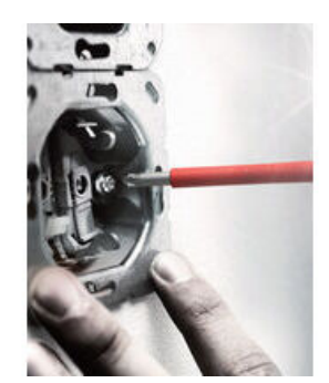
For the use in terminal blocks, control cabinets, switches, relays, sockets etc.