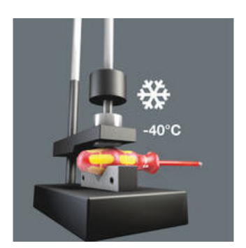
Impact strength tested at -40°C, guaranteeing safety even under extreme conditions.