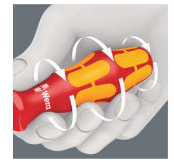
The hard materials used for the handle ensure rapid hand repositioning without any danger of the skin "sticking" to the handle. The surrounding hard zones with large diameters glide like wheels through the hand.