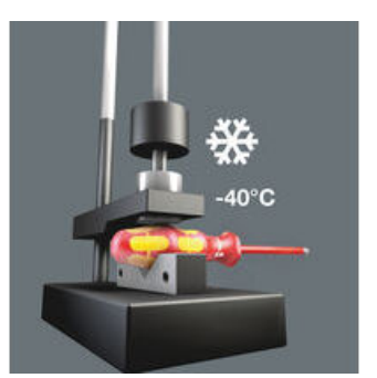
Impact strength tested at -40°C, guaranteeing safety even under extreme conditions.