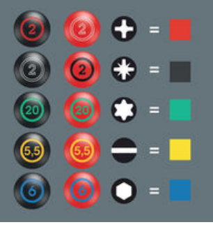
Screwdrivers with "Take it easy" tool finder: colour coding according to profile and size stamp.