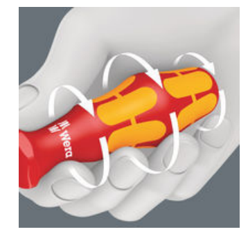
The hard materials used for the handle ensure rapid hand repositioning without any danger of the skin "sticking" to the handle. The surrounding hard zones with large diameters glide like wheels through the hand.