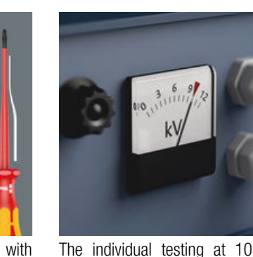
The individual testing at 10,000 volts, in accordance with IEC 60900, ensures safe working with loads up to 1,000 volts.