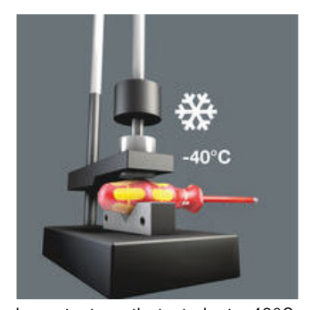
Impact strength tested at -40°C, guaranteeing safety even under extreme conditions.