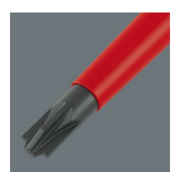
For the use in terminal blocks, control cabinets, switches, relays, sockets etc.