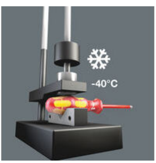
Impact strength tested at -40°C, guaranteeing safety even under extreme conditions.