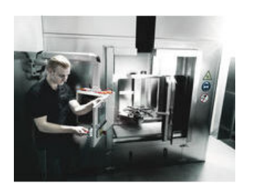
The individual testing at 10,000 volts, in accordance with IEC 60900, ensures safe working with loads up to 1,000 volts.