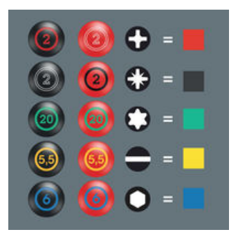
Screwdrivers with "Take it easy" tool finder: colour coding according to profile and size stamp.