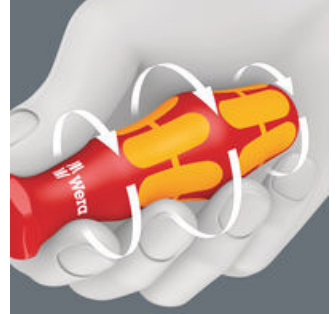
The hard materials used for the handle ensure rapid hand repositioning without any danger of the skin "sticking" to the handle. The surrounding hard zones with large diameters glide like wheels through the hand.