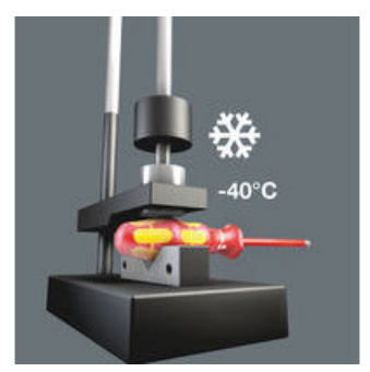
Impact strength tested at -40°C, guaranteeing safety even under extreme conditions.