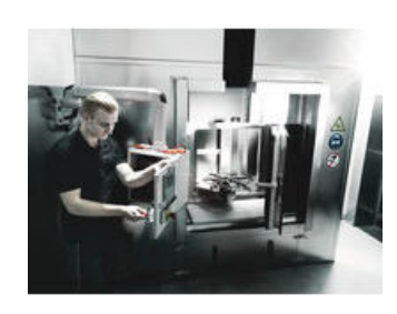
The individual testing at 10,000 volts, in accordance with IEC 60900, ensures safe working with loads up to 1,000 volts.