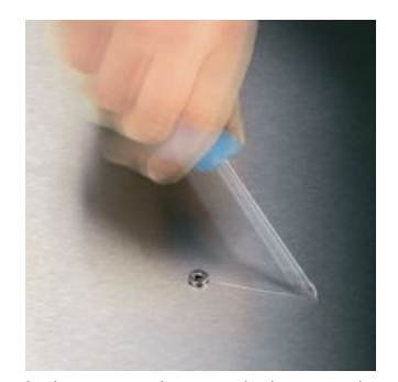
It happens time and time again that the tip slips out of the screw head when screwdriving, sometimes damaging valuable surfaces or even causing injury. The tips of the Wera Lasertip screwdrivers are microscopically roughened by means of a laser. This rough surface literally "bites" itself firmly into the screw head. Slipping out becomes a thing of the past.