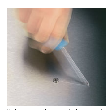
It happens time and time again that the tip slips out of the screw head when screwdriving, sometimes damaging valuable surfaces or even causing injury. The tips of the Wera Lasertip screwdrivers are microscopically roughened by means of a laser. This rough surface literally "bites" itself firmly into the screw head. Slipping out becomes a thing of the past.