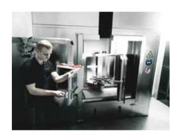
The individual testing at 10,000 volts, in accordance with IEC 60900, ensures safe working with loads up to 1,000 volts.