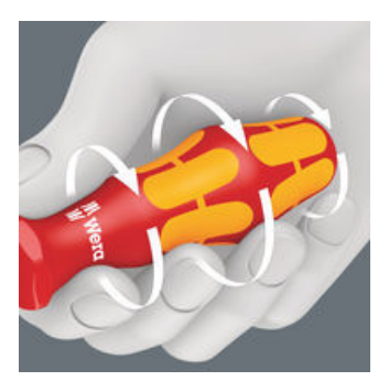
The hard materials used for the handle ensure rapid hand repositioning without any danger of the skin "sticking" to the handle. The surrounding hard zones with large diameters glide like wheels through the hand.