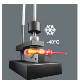
Impact strength tested at -40°C, guaranteeing safety even under extreme conditions.