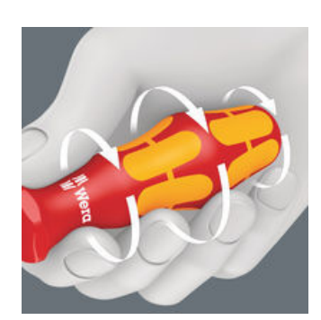
The hard materials used for the handle ensure rapid hand repositioning without any danger of the skin "sticking" to the handle. The surrounding hard zones with large diameters glide like wheels through the hand.