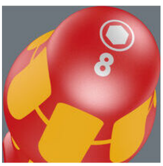
The screw symbol and tip size identification markings on the handle make it easier to find the right screwdriver in the tool case, or at the workplace.