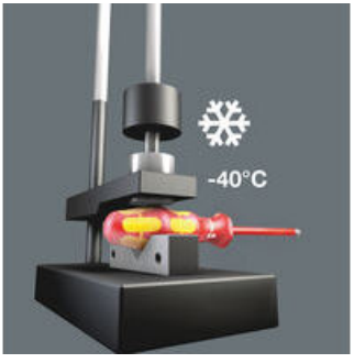
Impact strength tested at -40°C, guaranteeing safety even under extreme conditions.