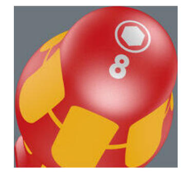
The screw symbol and tip size identification markings on the handle make it easier to find the right screwdriver in the tool case, or at the workplace.