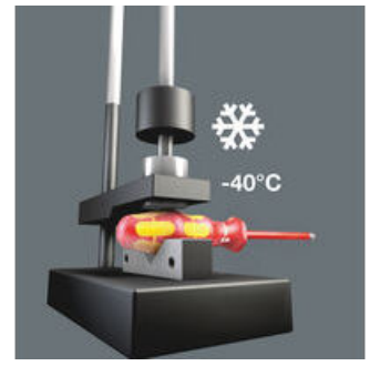
Impact strength tested at -40°C, guaranteeing safety even under extreme conditions.