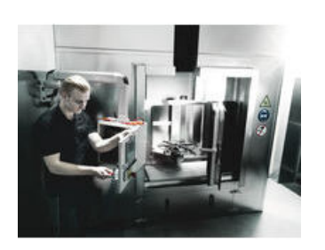
The individual testing at 10,000 volts, in accordance with IEC 60900, ensures safe working with loads up to 1,000 volts.