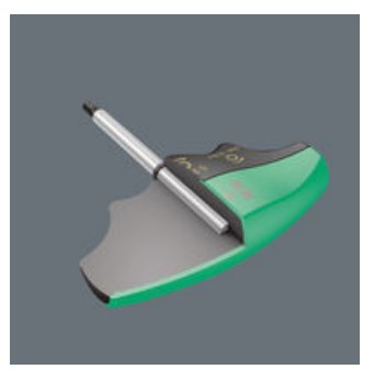
Multi-component screwdriver handle for ergonomic working.