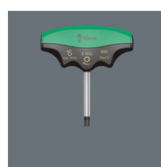
Suitable for applications requiring a non-adjustable i.e. a tamperproof torque blade assembly.