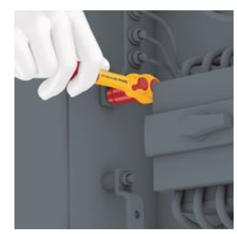
The extremely slim design of the Zyklop VDE ratchet makes it easy to work, even in confined spaces.