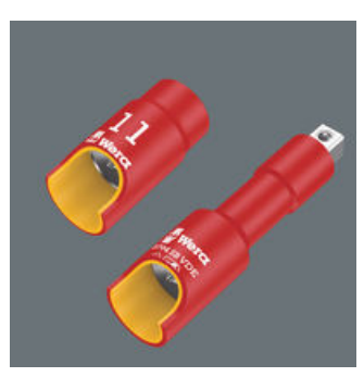
The Zyklop sockets and extensions for electricians offer increased safety thanks to their 2-component isolation with yellow insulation core under red insulation outer layer.