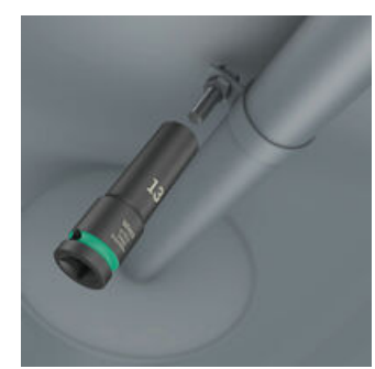
Due to the long design of the socket, screwdriving can also be achieved in small spaces. Fittings with protruding threaded rods are often also possible.