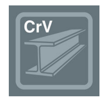
The chrome-vanadium steel version makes the plug-in tools suitable for heavy loads.