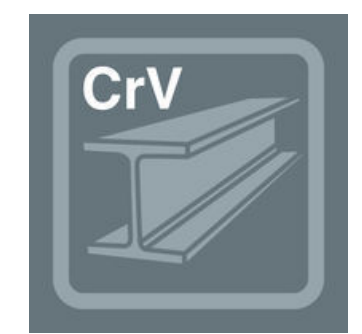
The chrome-vanadium steel version makes the plug-in tools suitable for heavy loads.