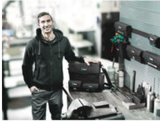
Wera 2go 2 - The outside and inside packer