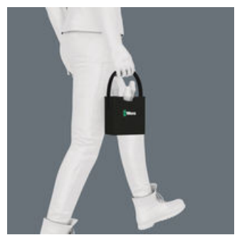
The large set-down area improves the stability of the Tool Quiver. Its large handle means that the quiver can be easily transported or simply hung up at the workplace.