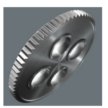
Fine-pitched with 72 teeth for a return angle of only 5°