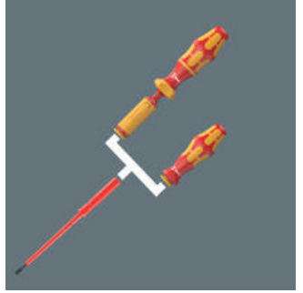
Suitable for Kraftform handles 7400 VDE, 827 T i and 817 VDE.