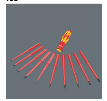
The handle/interchangeable blade system allows rapid exchange of the blades required for a wide range of applications.