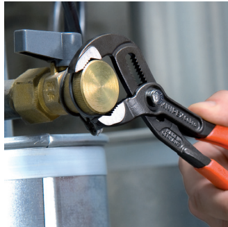
Fast and firm adjustment directly on the workpiece