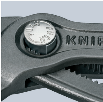
Fine adjustment by pushing a button: fast and comfortable

Pliers with integrated tether attachment point for tool drop protection system