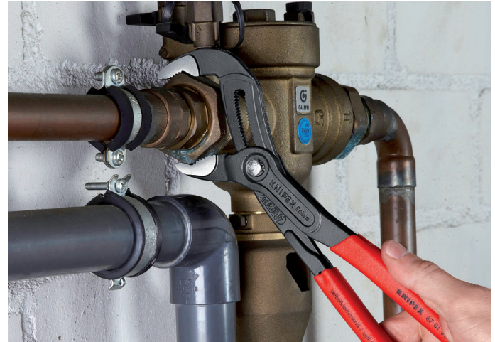
Teeth set against the direction of rotation have a self-clamping effect and prevent slipping off the workpiece