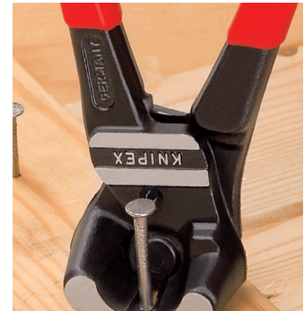
Almost flush cutting of bolts, nails, etc.