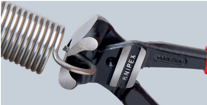
High cutting performance: also for piano wire