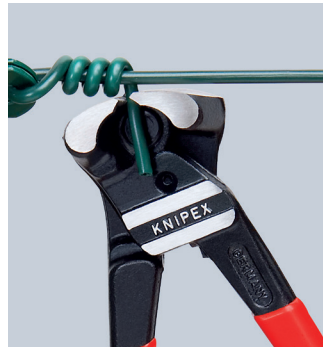
Perfect for working with fencing