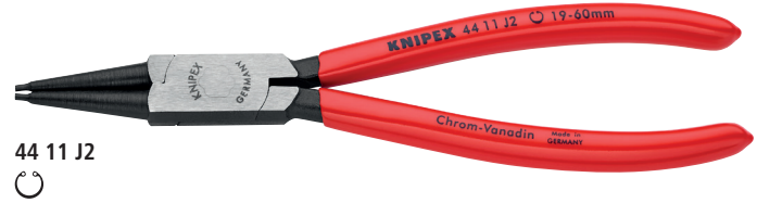
44 11 J2 ○