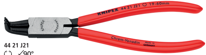
44 21 J21 ○ ∠90°