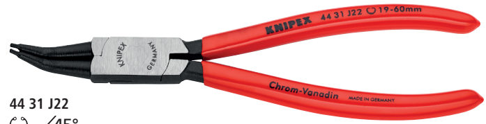
44 31 J22 ○ ∠45°