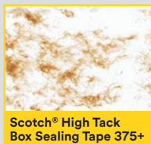
Scotch® High Tack Box Sealing Tape 375+