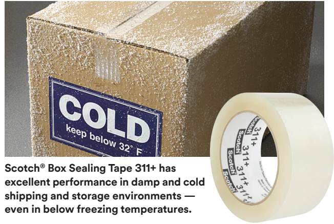
Scotch® Box Sealing Tape 311+ has excellent performance in damp and cold shipping and storage environments — even in below freezing temperatures.