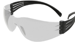
SF107AF-BLK 7100238257 Lens: Indoor/Outdoor, AF/AS Frame Color: Black