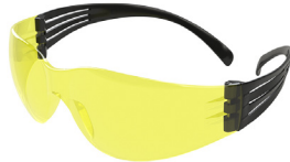
SF103AF-BLK 7100238183 Lens: Amber, AF/AS Frame Color: Black