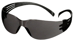
SF102AF-BLK 7100238172 Lens: Grey, AF/AS Frame Color: Black