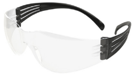
SF101AF-BLK 7100238174 Lens: Clear, AF/AS Frame Color: Black