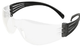
SF101AS-BLK 7100238173 Lens: Clear, AS Frame Color: Black