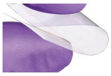
Very good flexibility