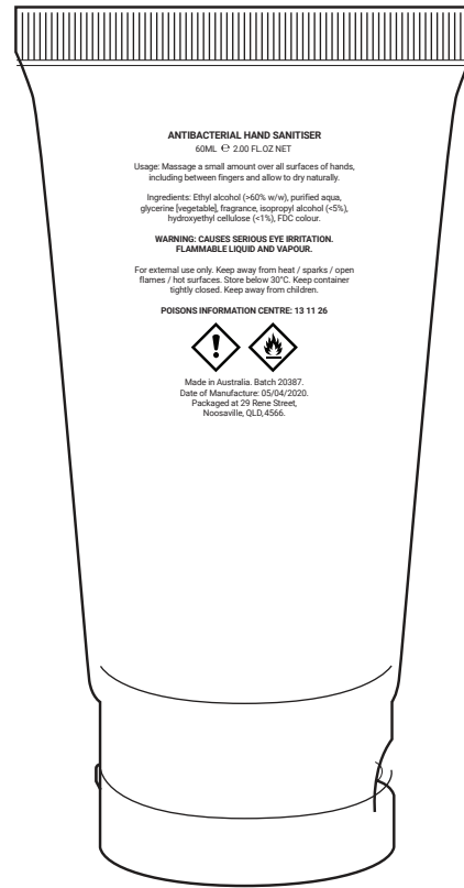
Pad print side 2