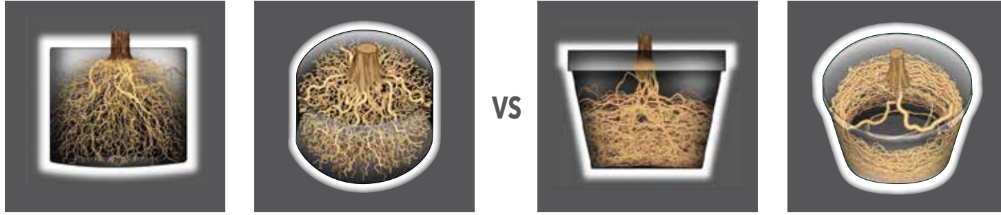
Smart Pot's patented fabric containers promote a denser root mass than typical plastic containers.