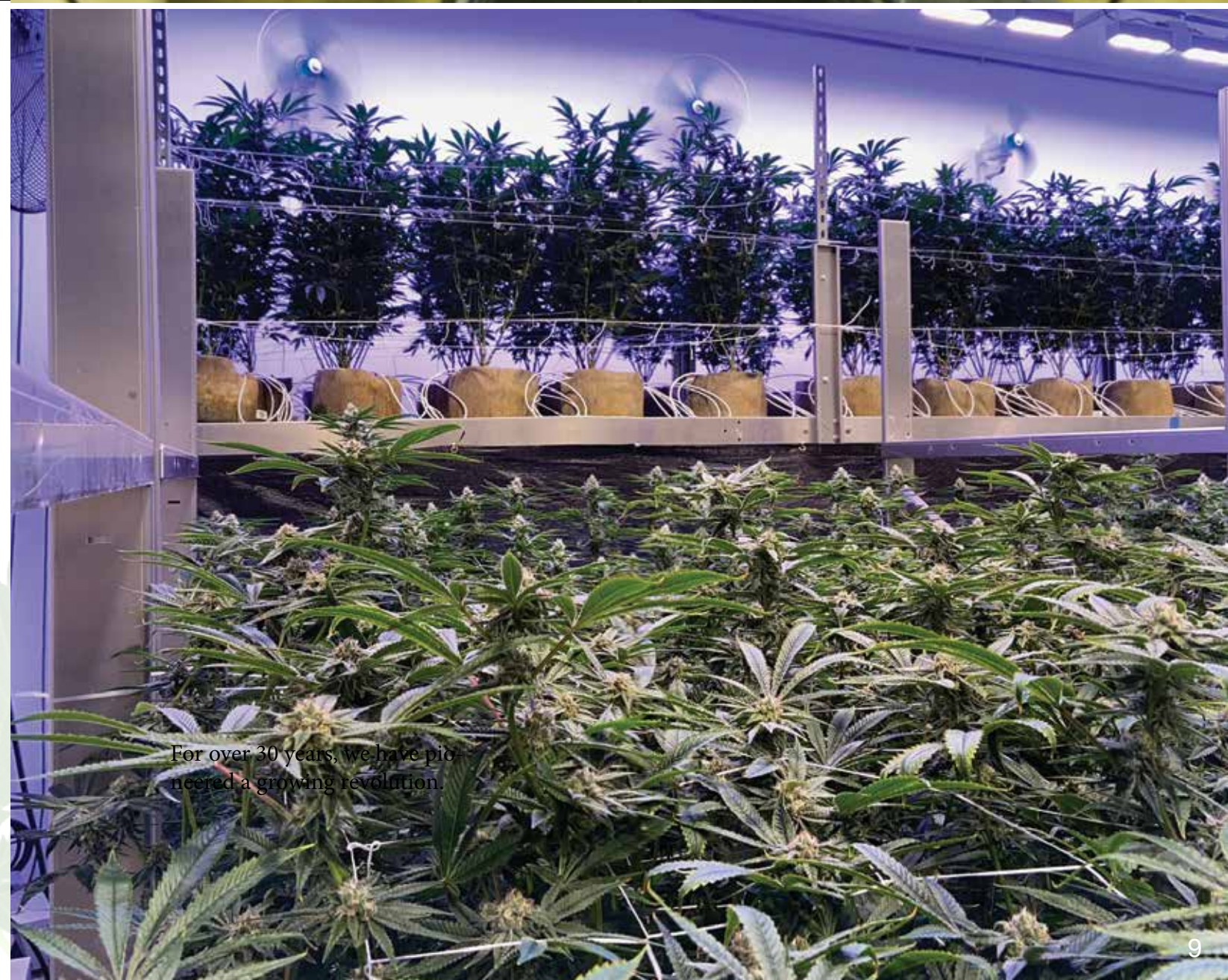
For over 30 years, we have pioneered a growing revolution.