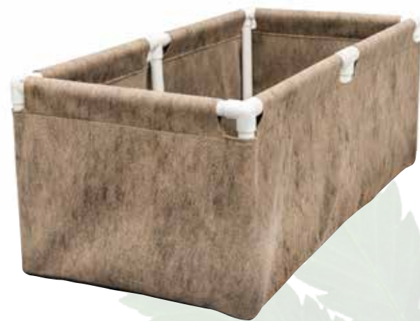
Smart Pot PVC Ready Raised Beds are designed to maximize your canopy space.