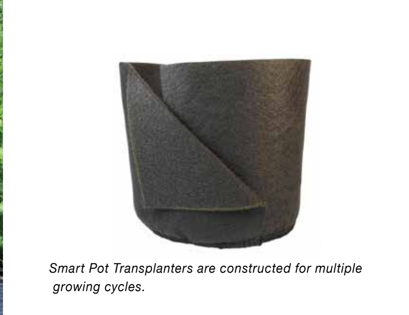
Smart Pot Transplanters are constructed for multiple growing cycles.