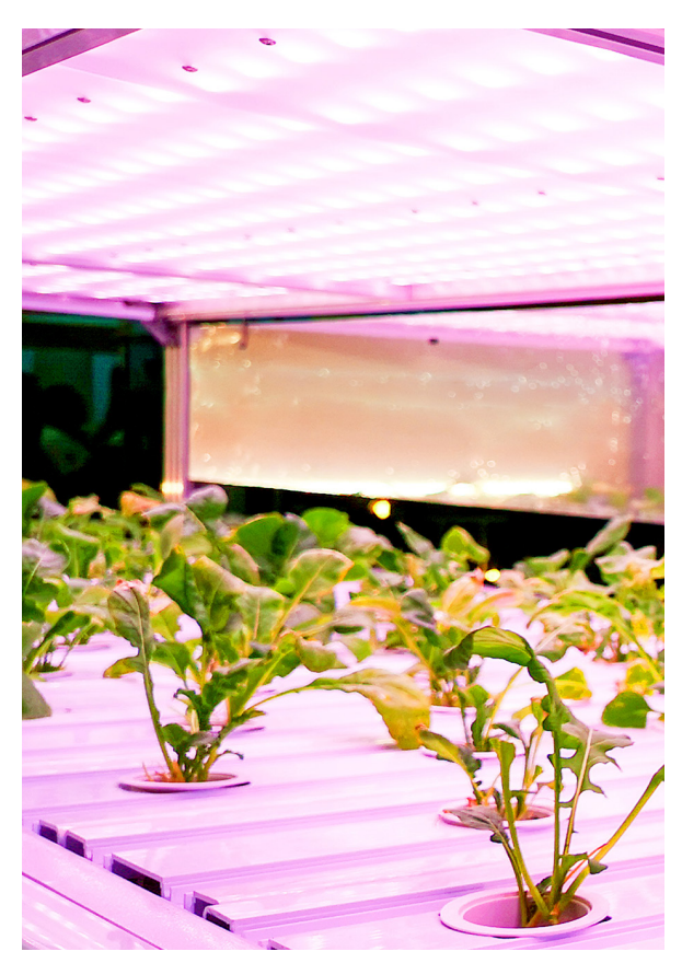
(For complete specifications, please visit our website)