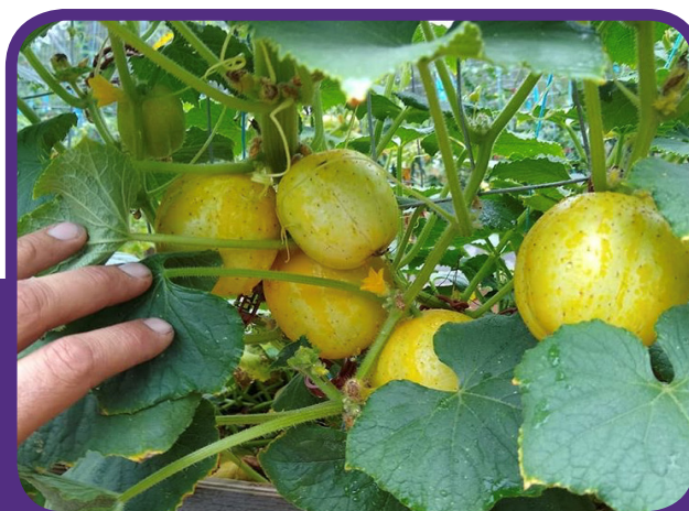
Robert Sochor, Bright Flower Farm

Available in: 1 Cubic Foot Bags (70 bags/pallet)