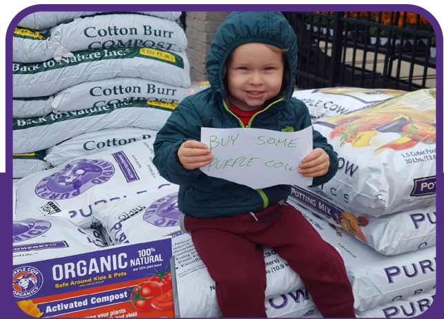
Red's Garden Center, Northbrook, IL

Available in: 1 Cubic Foot Bags (50 bags/pallet)