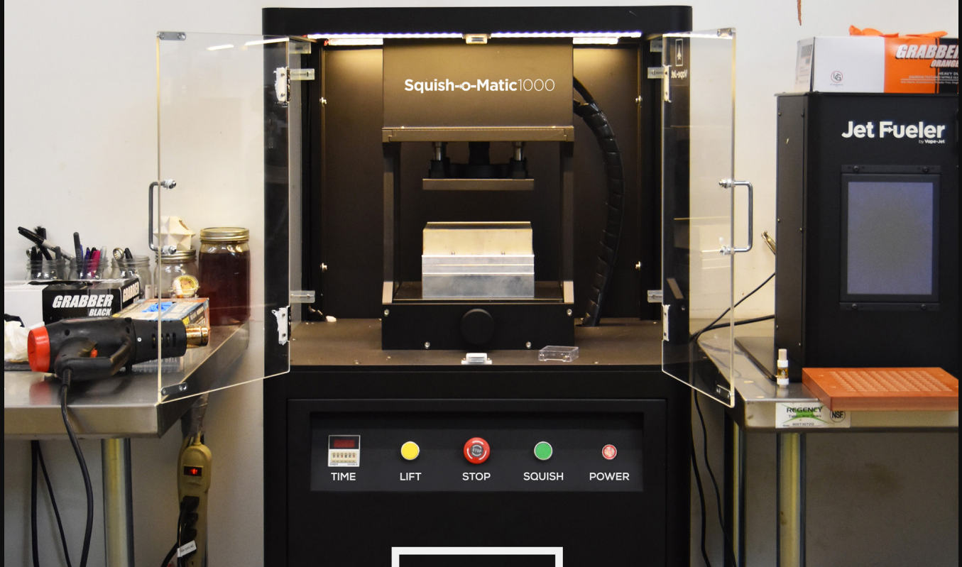
Photo of R&D Unit in use at Natural Roots OR