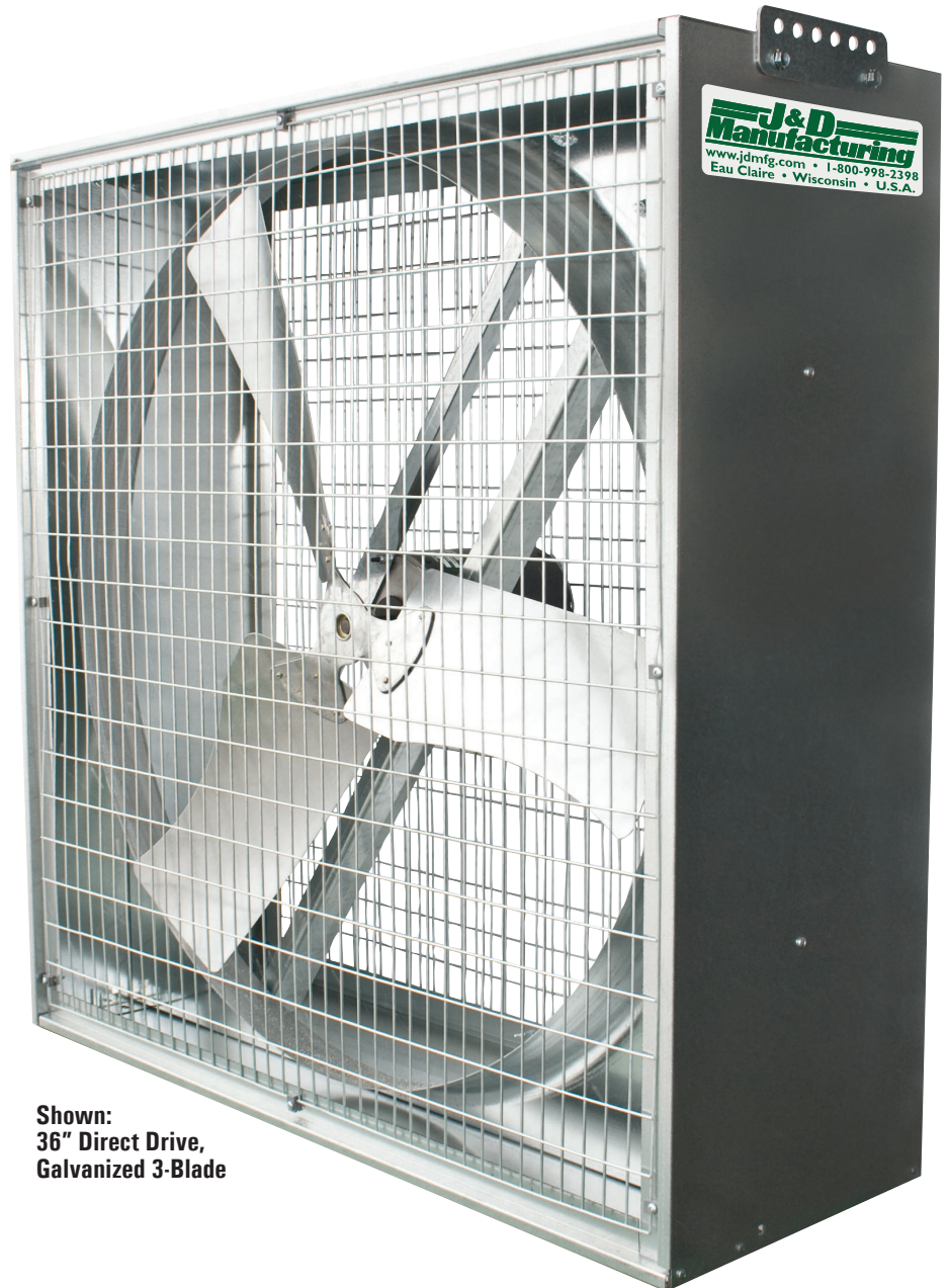
Shown: 36" Direct Drive, Galvanized 3-Blade

⚠ WARNING: This product can expose you to chemicals including lead, which is known to the State of California to cause cancer and birth defects or other reproductive harm. For more information go to www.P65Warnings.ca.gov/product .