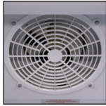
Interior cooling fan