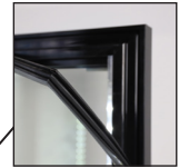
Magnetic gasket can be replaced without tools