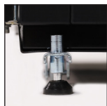
Four (4) rollers (2 with leveling feet)