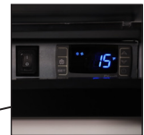
Electronic thermostat and digital LED temperature display provides accurate and easy reading