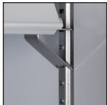
Four (4) adjustable heavy-duty PE-coated wire shelves per door, include pricing strips